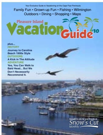
Pleasure Island Vacation Guide

Snow's Cut Media, LLC PO Box 334, Carolina Beach, NC 28428 • p: 910-458-0120 www.pleasureislandvacationguide.com