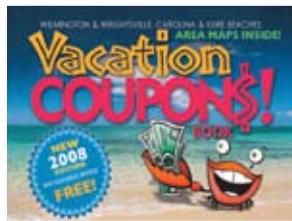
Vacation Coupons! Book